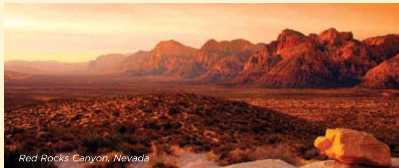
Red Rocks Canyon, Nevada